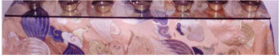
Buddhist shrine on the main floor of the Kalapa Court in Boulder, 1982.