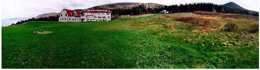
Gampo Abbey on Cape Breton island

But let me back up for a minute. Before that, during (I think) the 1982 Seminary, I put in a request through Beverley: Could I see Rinpoche to just talk about the monastery? And that afternoon, I got a message that I should come then, which was pretty unusual. I had been to quite a few meetings with Rinpoche and they had always been in a living room or a sitting room with Rinpoche sitting in his chair and I'd be sitting on the couch or something, usually discussing practice and study issues or whatever. So I arrived expecting it would be like that, but instead I was ushered into the bedroom. All the curtains were drawn and Rinpoche was sitting on the bed. I said something like, "This is a really odd environment for having our discussion about the monastery." He didn't crack a smile. He was dead serious. He beckoned for me to come over and sit on the floor next to the bed and then he told me several important things. I don't think I asked any questions, he was just telling me these things that he wanted me to know.